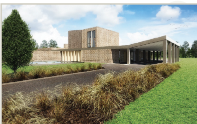
Below: Current progress on the Bereavement Services Complex build.